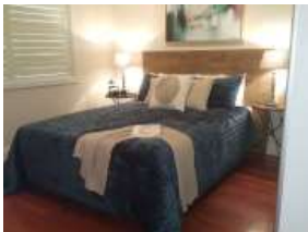
Door/S Hard Floor Finishes Wall Maintenance

The door was tested and was in working order on inspection. The floating flooring is in reasonable condition with no major defects visible. The walls are in reasonable condition with high moisture readings.