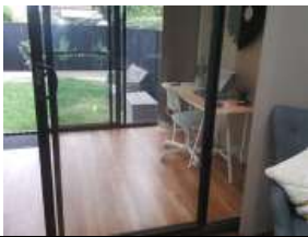
Hard Floor Finishes Walls Ceiling Finishes Elec

The doors were tested and were in working order on inspection. It would be advisable to have safety strips applied to all full height glass throughout to prevent accident or possible serious injury.