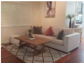
Door/ Frame Maintenance

The door was tested and was in working order however it is ill fitting.