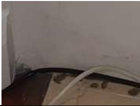
Ceiling Finishes Elec

The ceiling is in reasonable condition with no major defects visible. The light and power were tested and were in working order at the time of inspection.