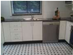
Hard Floor Finishes

The floor tiles are in reasonable condition with no major defects visible.